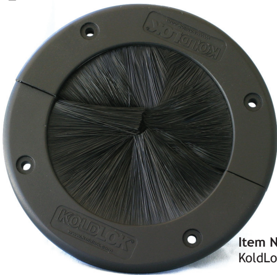
Item No.40001 KoldLok Round 4"