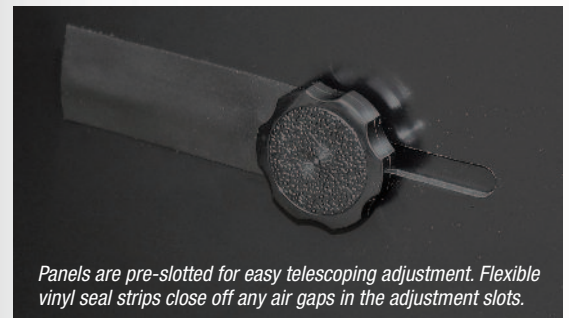
Panels are pre-slotted for easy telescoping adjustment. Flexible vinyl seal strips close off any air gaps in the adjustment slots.