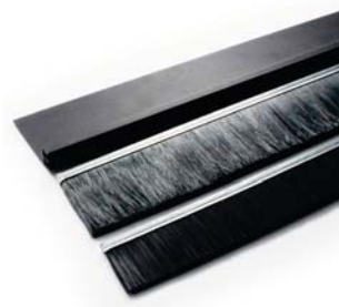
Extended 3" x 60" Brush Grommet Part No. 10097