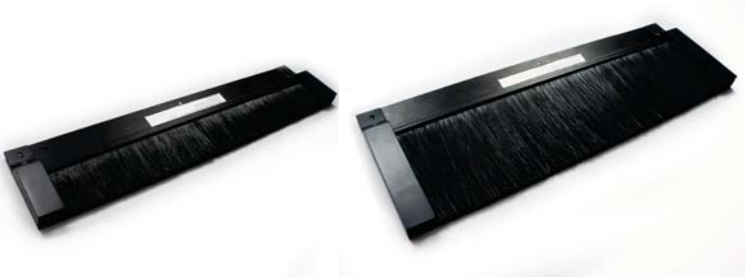
Extended 3" x 24" Brush Grommet Part No. 10012