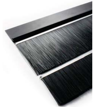
Extended 6" x 60" Brush Grommet Part No. 10098